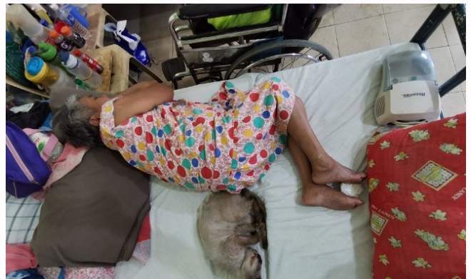
FELINE COMPANIONS. Cats are known to look for somewhere quiet and peaceful to sleep. This stray cat found exactly just that as it became the sleeping buddy of this female elderly at the now improved St. Francis Female Ward, Emmaus House of Apostolate in San Agustin, Bulacan